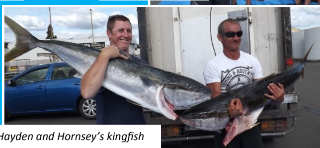
Hayden and Hornsey's kingfish